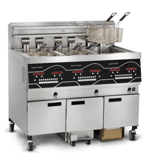
EEE 143 3-well open fryer